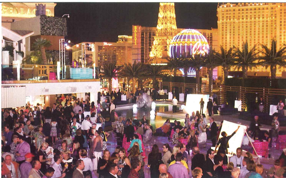
Ensemble staged one of its largest conferences ever at The Cosmopolitan Las Vegas in October.

Benefit from a growing hotel and resort collection. Like other travel agency groups, Ensemble has dedicated a collection of nearly